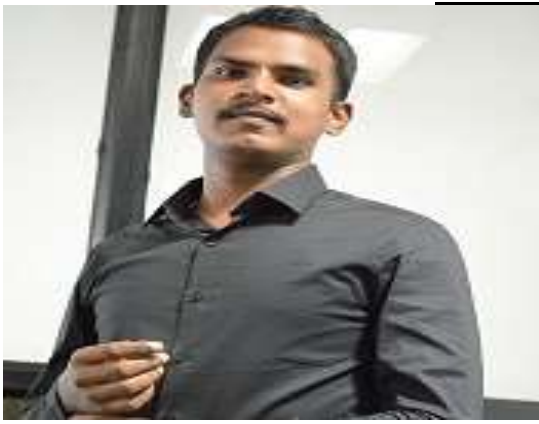
MR.P.ARUL RESUF,TN POLICE