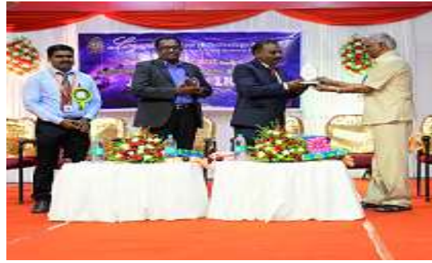
A Symposium organized by ECE Departments “PILOFORIES” – 2k19” On 27-08-2019.